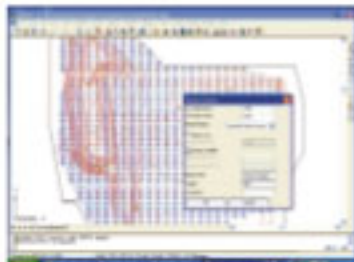
Earthwork and material quantities