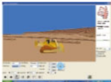
Models visually checked for accuracy

GeoShack's expert staff provides top quality Data for all brands of Machine Control using the latest and best software available for your application. Our years of real world experience and ability to stay on top of the changing technology assures our customers the best Data possible!